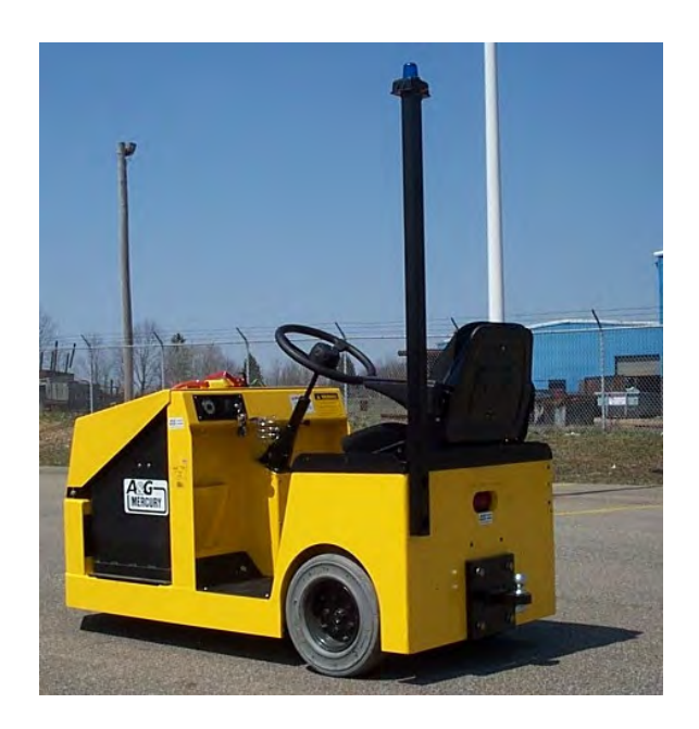
Note: Shown with Optional Strobe, Quick Charge Battery Connectors, & Rear Ball Hitch.

Under side of Frame Shows the one-piece welded frame, as well as the strength of the frame due to the inner frame rails.