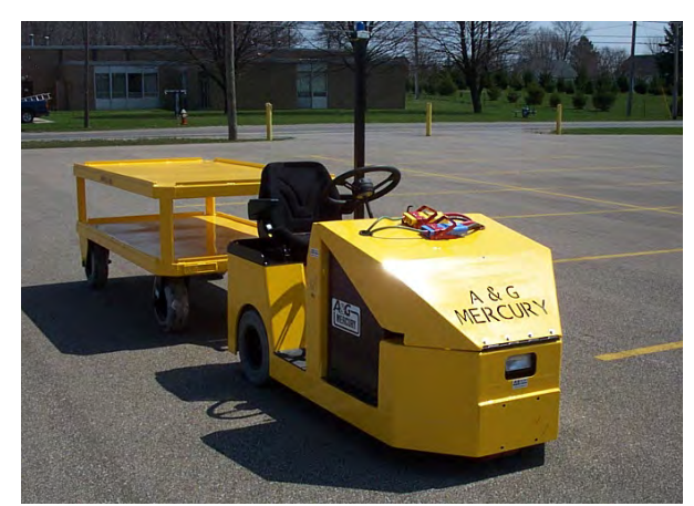
Note: Shown with Optional Strobe, and Optional Quick Charge Battery Connectors, & A & G Mercury Trailer.